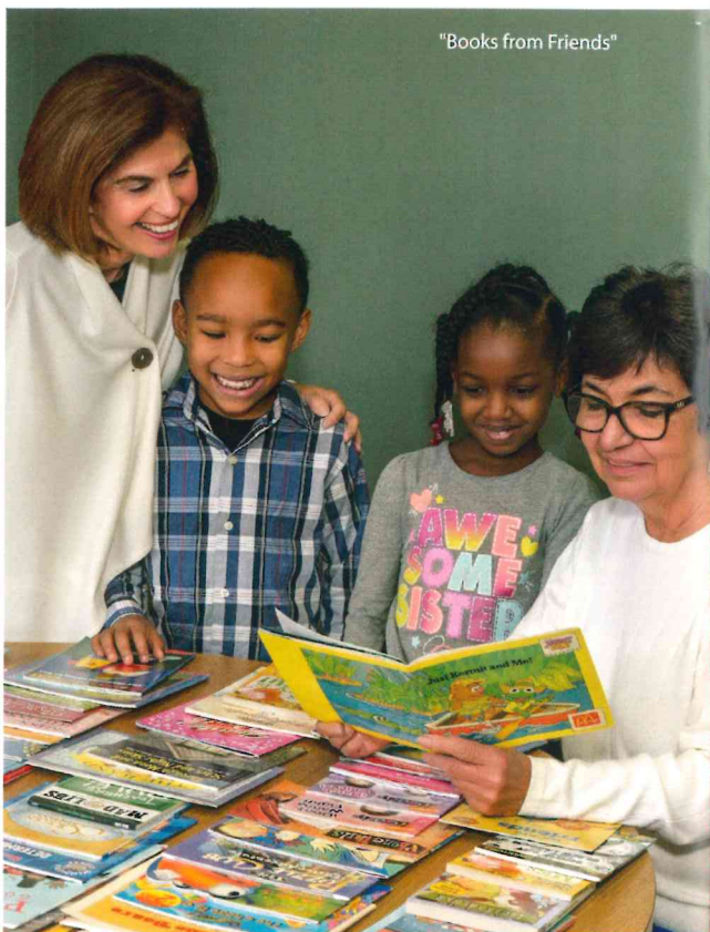
"Books from Friends"