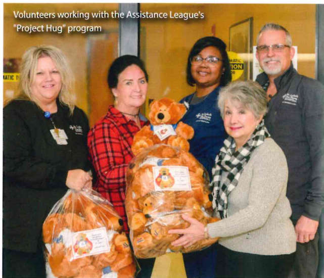
Volunteers working with the Assistance League's "Project Hug" program